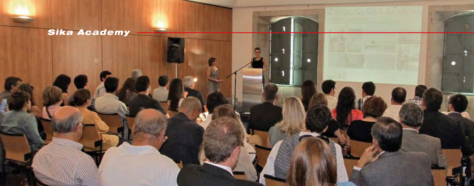
Official ceremony of the 1 st Sika Academy Contest at Alfândega do Porto, in Oporto/Portugal