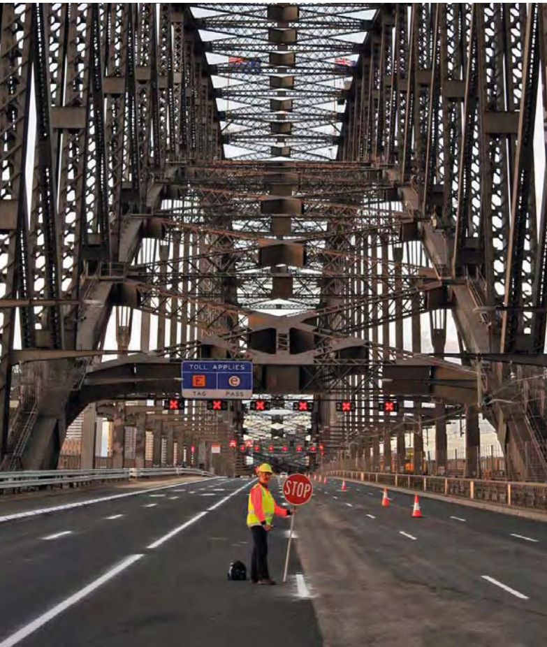
Harbour Bridge, Sydney/Australia