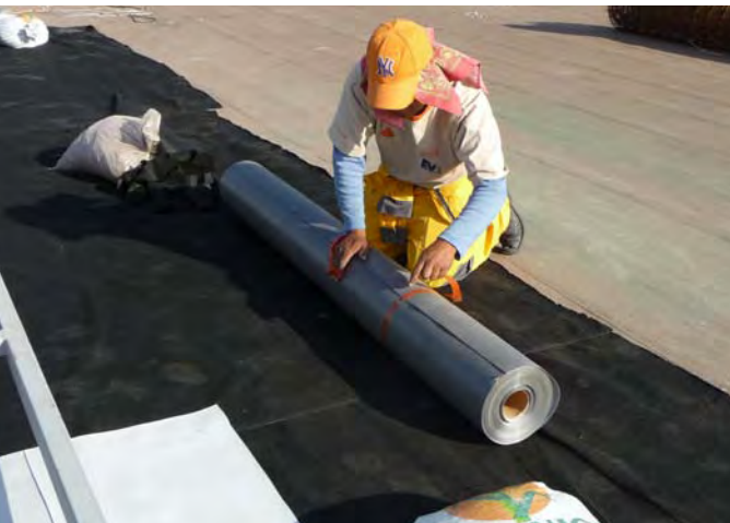
Construction in progress: placing protective geotextile over the concrete deck

Covering an area of approximately 5.000 m 2 , this green roof on top of the INFONAVIT building is currently the largest in Latin America. It was installed on a concrete deck placing first a protective geotextile, upon which the PVC waterproofing membrane Sika Sarnafil was placed. Over the PVC membrane was placed a drainage layer, which allows an easy flow of rain water. Prior to adding soil and vegetation, a layer of geotextile was laid in order to prevent the passage of fine content in the soil which could obstruct the downspouts.