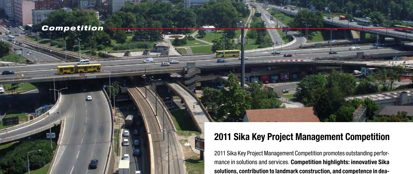
Gazela Bridge, Belgrade/Serbia