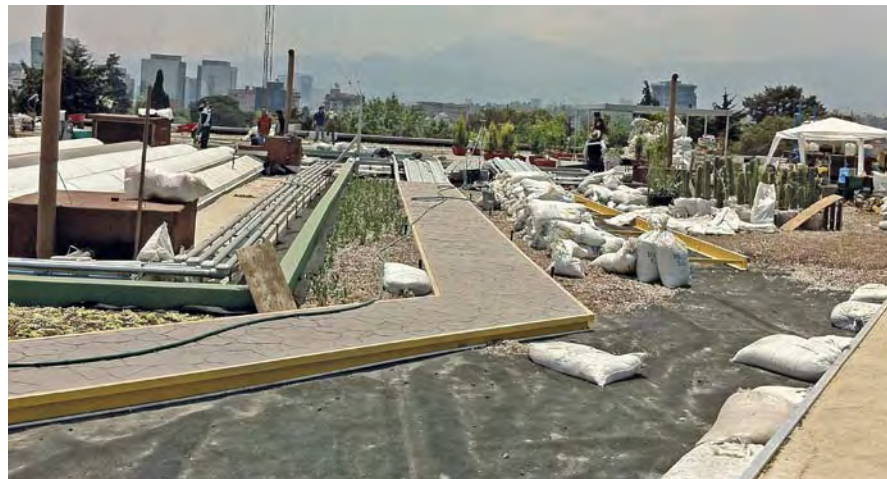
Becoming green: adding soil and vegetation